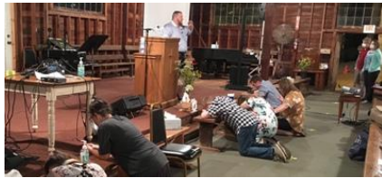
Gospel preaching 7pm weeknights 6pm weekends