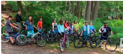
No cost Family Activities daily