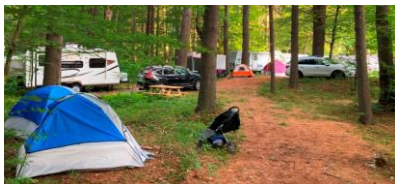
Serene, Sacred, Celestial