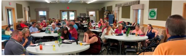
Daily 10am Bible Studies (and VBS ages 4-12)